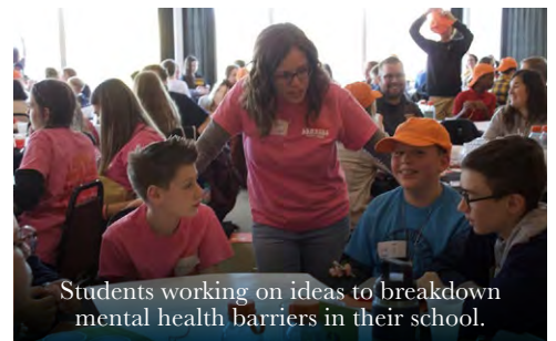
Students working on ideas to breakdown mental health barriers in their school.