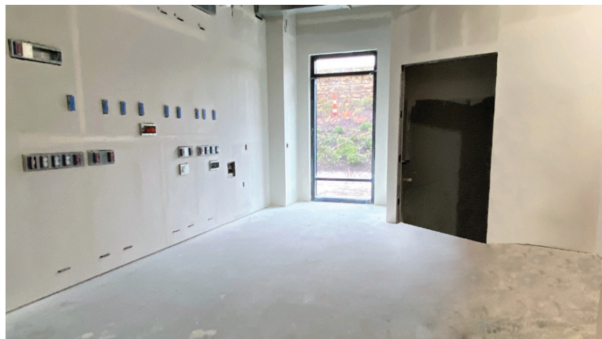
Intensive Care Unit private patient room — the headwall is on the left in both images. The room above faces south with a view of the newly planted landscaping. Rooms facing north and west will have a view of the bay, as depicted in the rendering to the left.