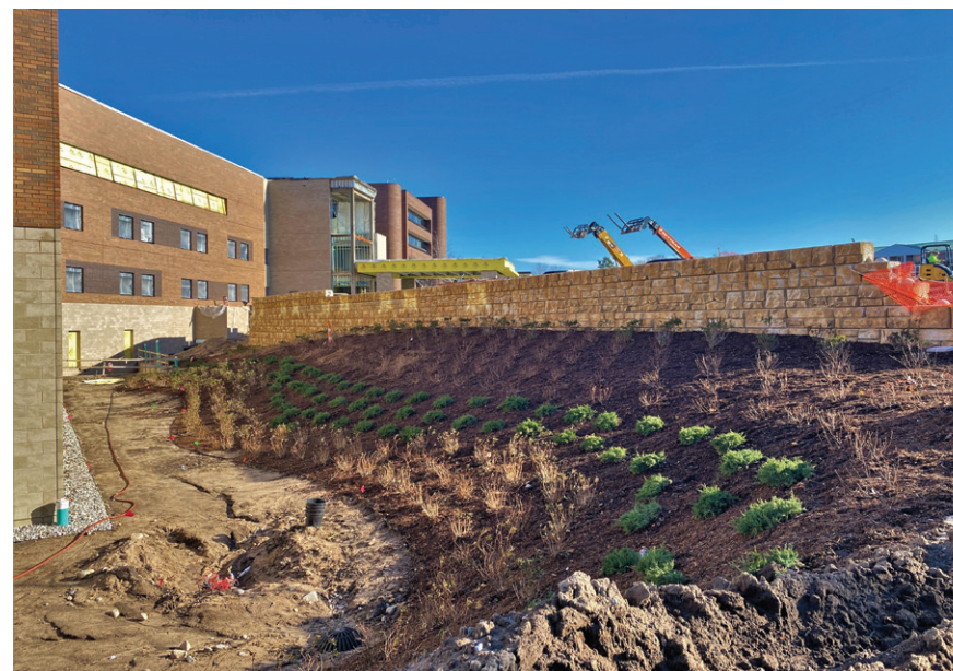
In the fall, a sculptural stone wall and landscaping featuring native species were installed to provide a beautiful view for the new south-facing private patient rooms.

It’s wonderful to see our vision for the future taking shape— in no time at all, doors will open to a new era of care! Whether in person, or via a virtual tour, we look forward to showing everyone how support of this project has built a better place to care for patients, host visitors, and for our medical teams to practice.