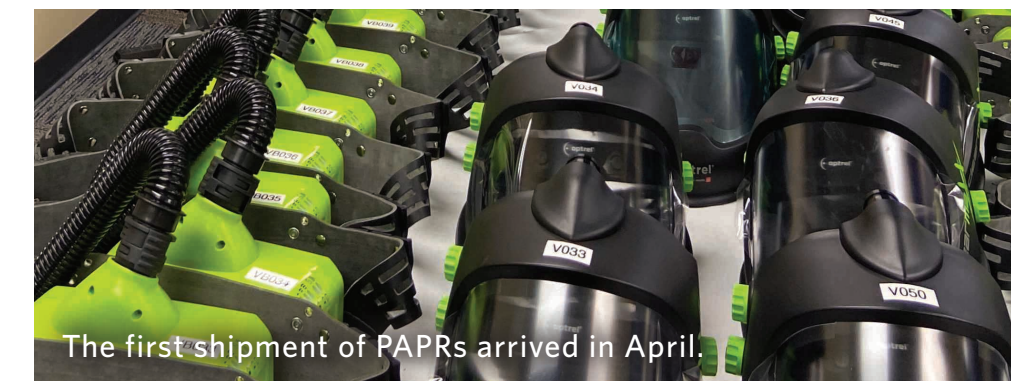
The first shipment of PAPRs arrived in April.