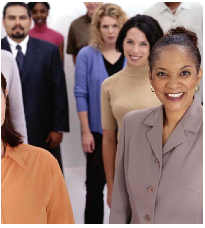
Age, gender, heredity and race are among the stroke risk factors that you can't control.