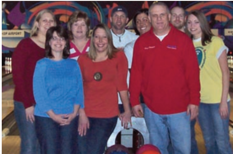
MRMC therapy services employees, family members and friends.