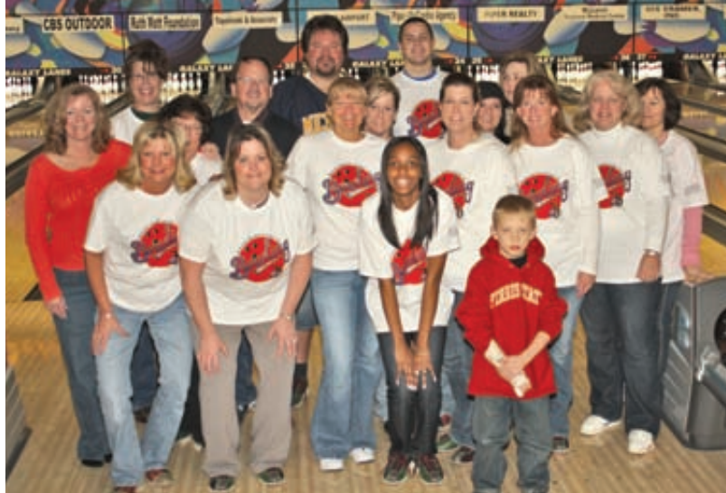
MMMI employees, family members and friends.