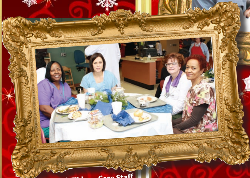
(Above) Kidney Care Staff