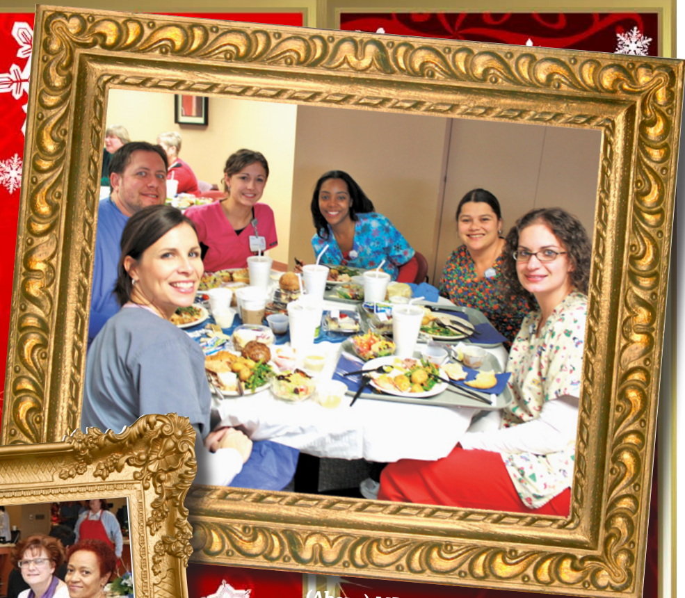
(Above) MRMC Radiology staff members