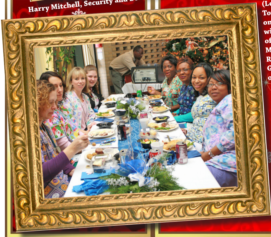
(Left) 12 Tower staff on left dine with members of Internal Medicine Residency Group Practice on right.