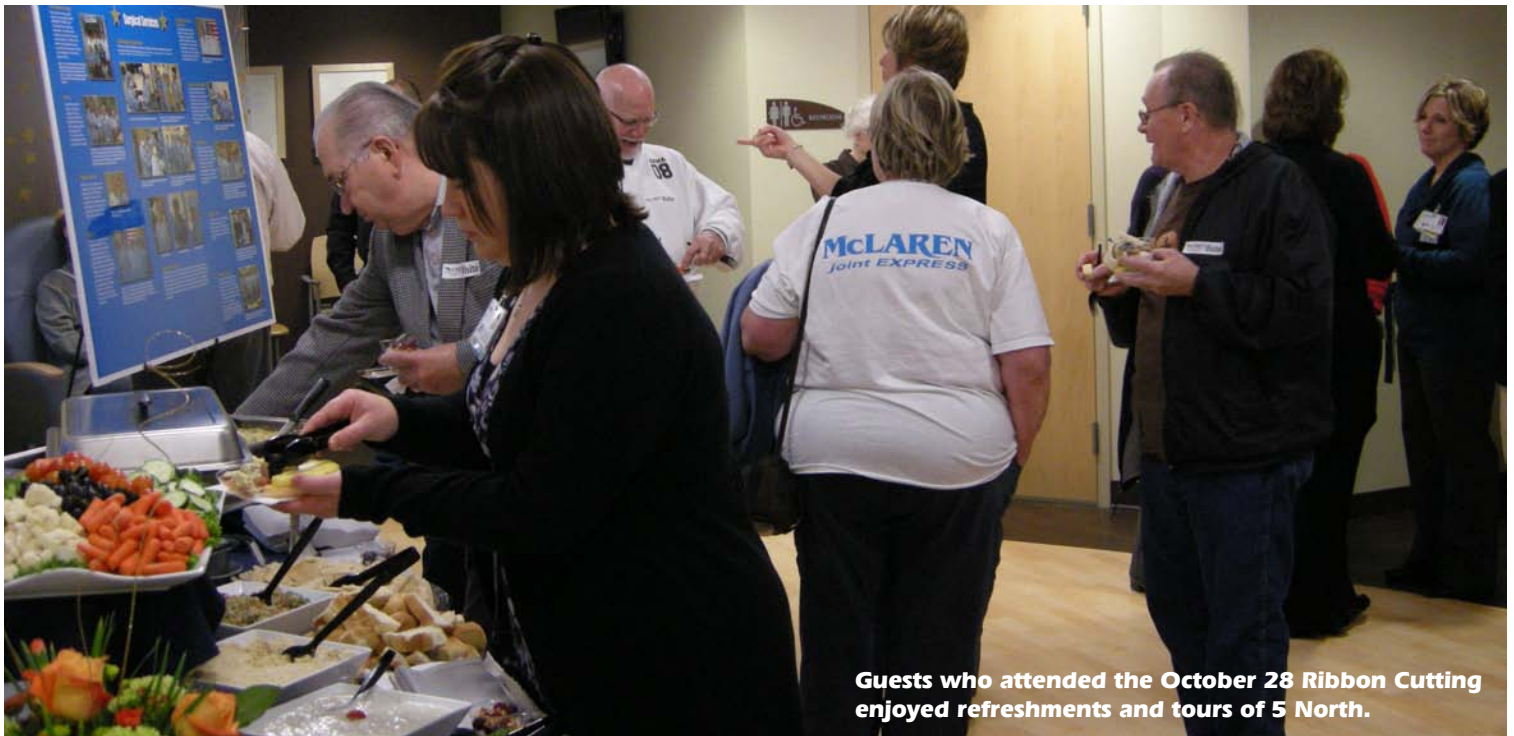
Guests who attended the October 28 Ribbon Cutting enjoyed refreshments and tours of 5 North.