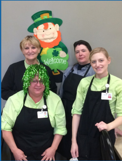
Food and Nutrition staff celebrating St. Patrick's Day