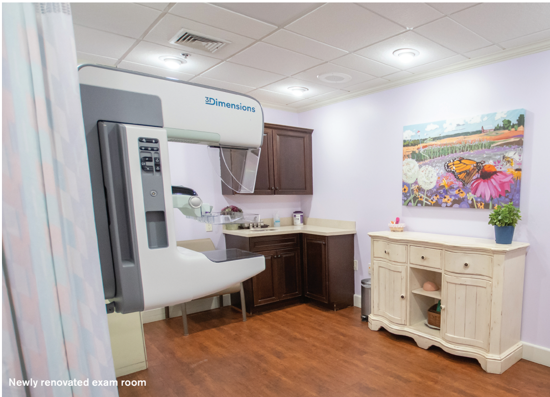
Newly renovated exam room