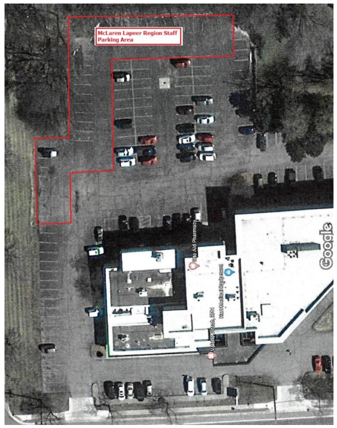
McLaren Lapeer Region Community Medical Center Parking