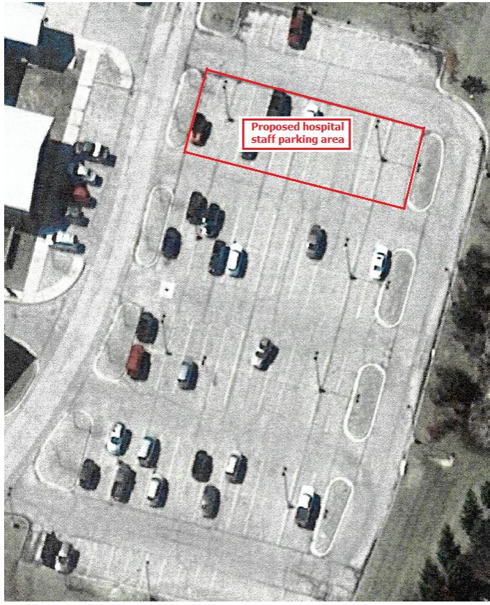
McLaren Lapeer Region – Karmanos Cancer Center Parking

An area of parking spaces located at the north end of the parking lot has been designated for hospital managerial staff parking. Hospital staff parking will not be allowed in any other area of the Cancer Center Parking Lot