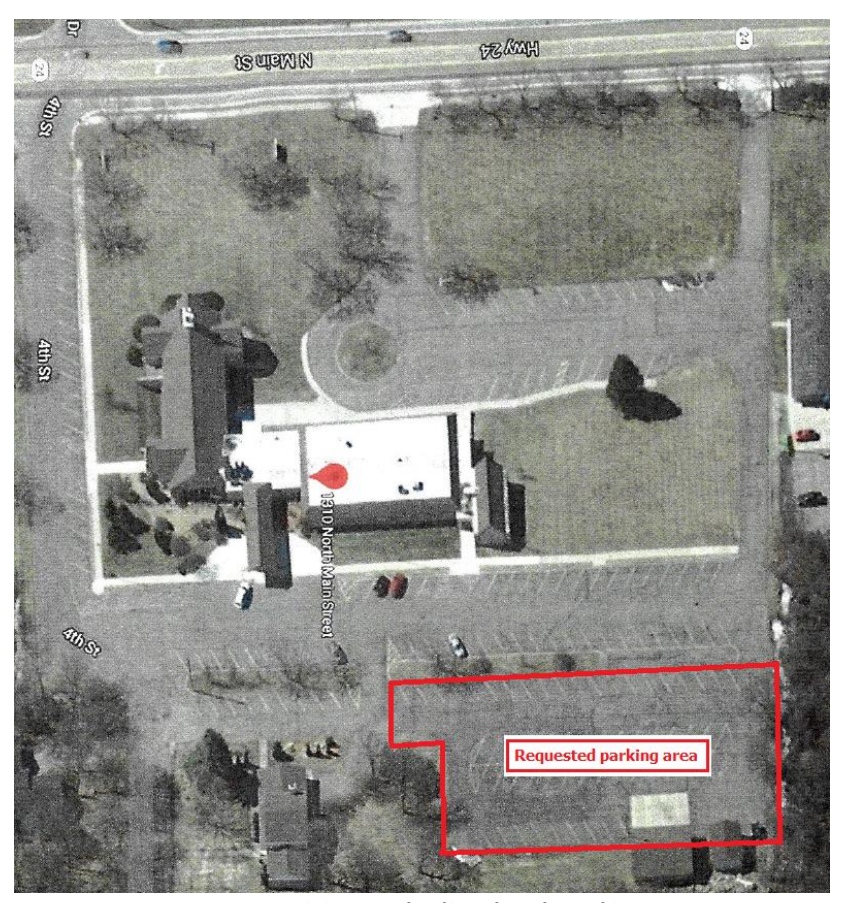
Lapeer Trinity Methodist Church Parking