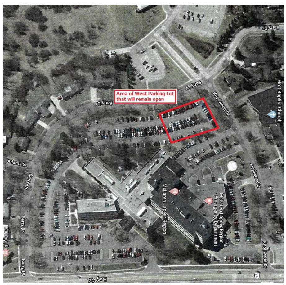
McLaren Lapeer Region West Parking Lot

7:00 AM to 7:30 PM staff members are asked to park in the North Parking, First Baptist Church, Lapeer Trinity United Methodist Church or McLaren Lapeer Region Community Center Parking Lots Monday through Friday.