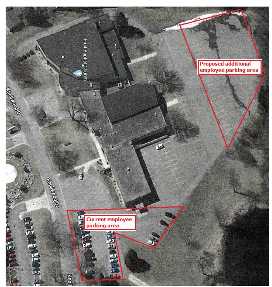
First Baptist Church Parking