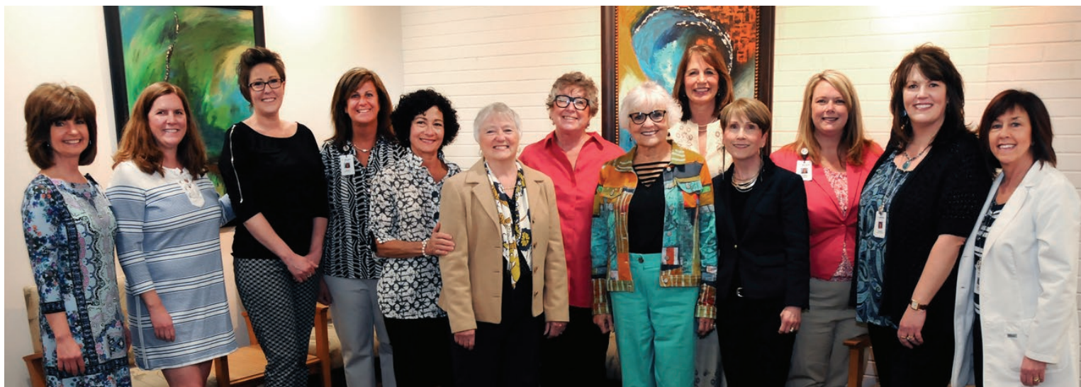
2018 members of the Community Advisory Board

McLaren Port Huron appreciates the many contributions the Women's & Children's Community Advisory Board members have made over the past 30 years as we continue "Doing What's Best" and for inspiring us to keep setting the bar higher and higher.