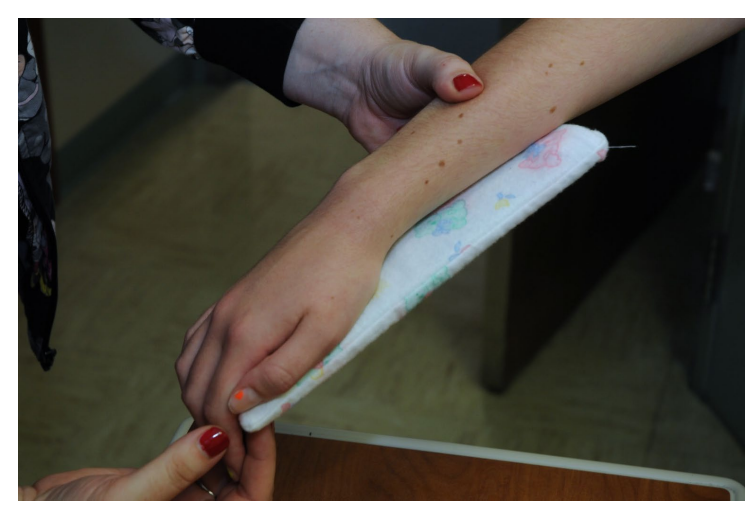
I might get some lab work or an X-ray.