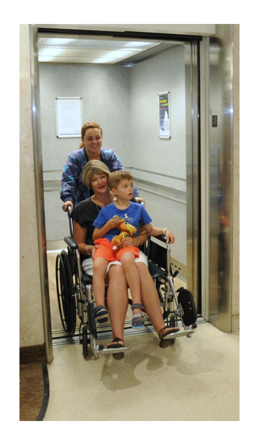
I will go down an elevator.