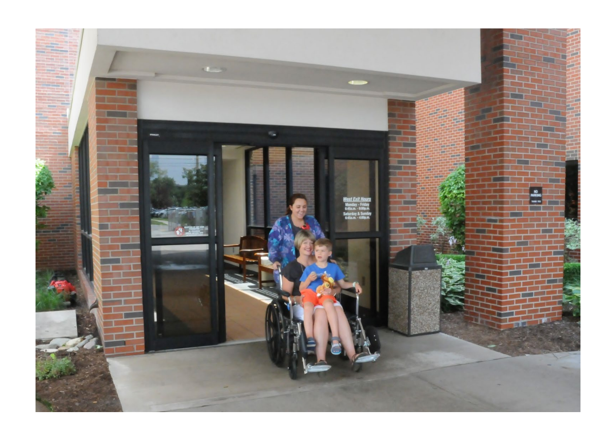
I will go home.