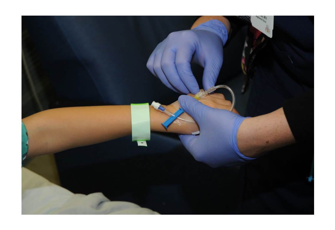
The nurse will check my IV.