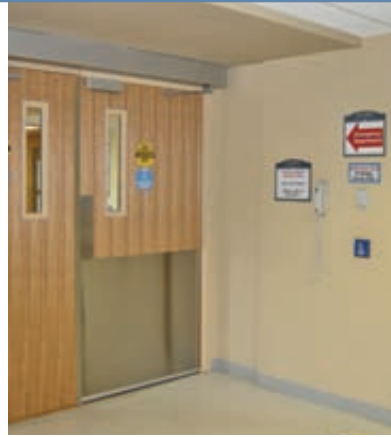
Inside ED Entrance