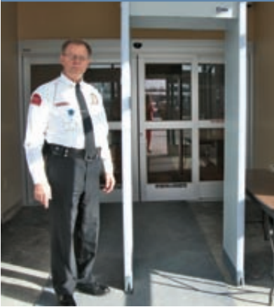
Outside ED Entrance