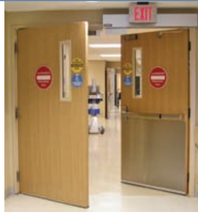
ED Work-Related Entrance